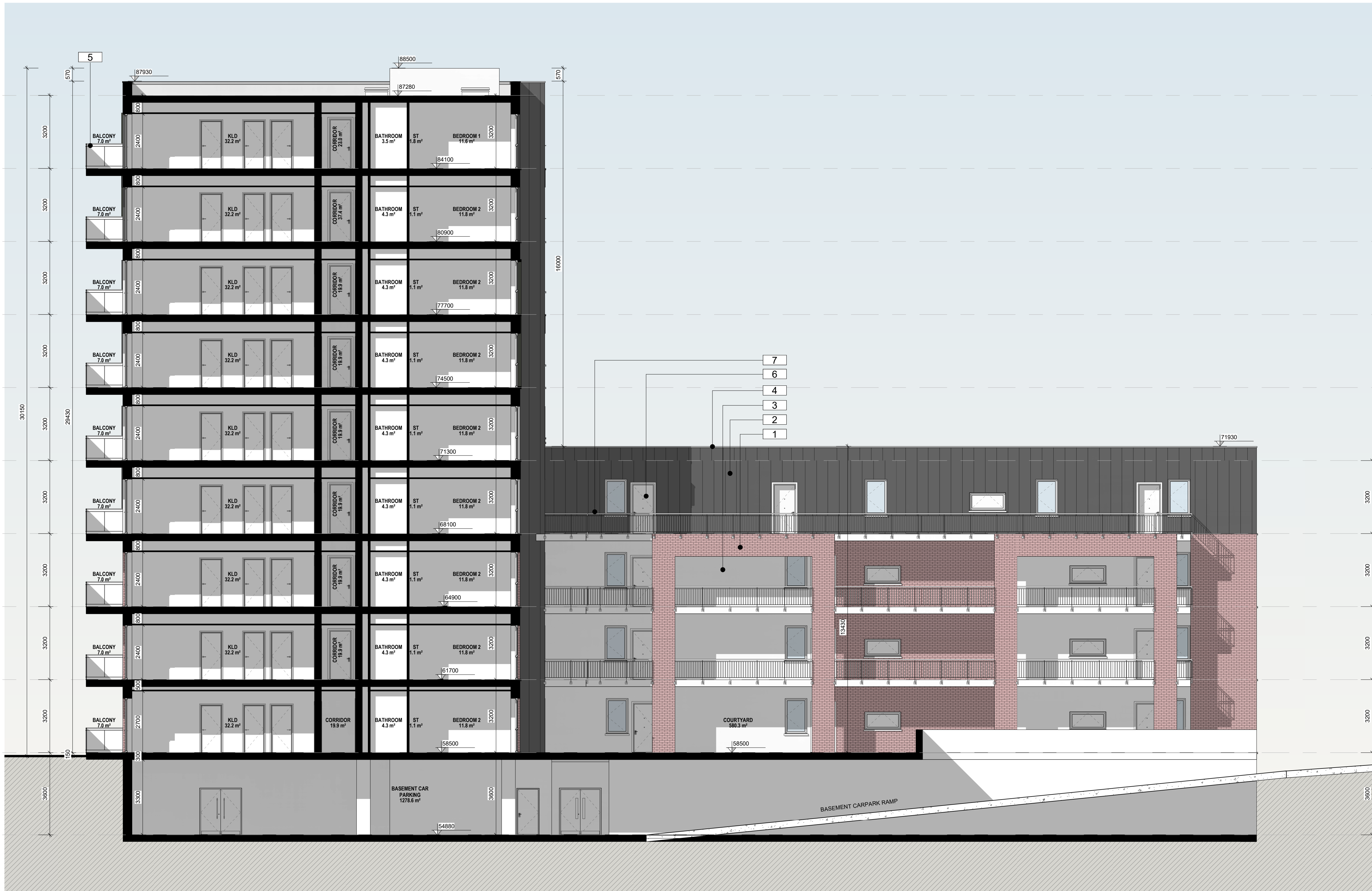
1 Courtyard North Elevation 1 : 100

Please consider the environment before printing this sheet